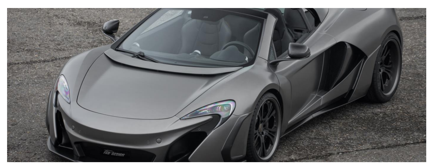
God of wind

Based on McLaren 650S FAB Design presents a wide body version named VAYU RPR: