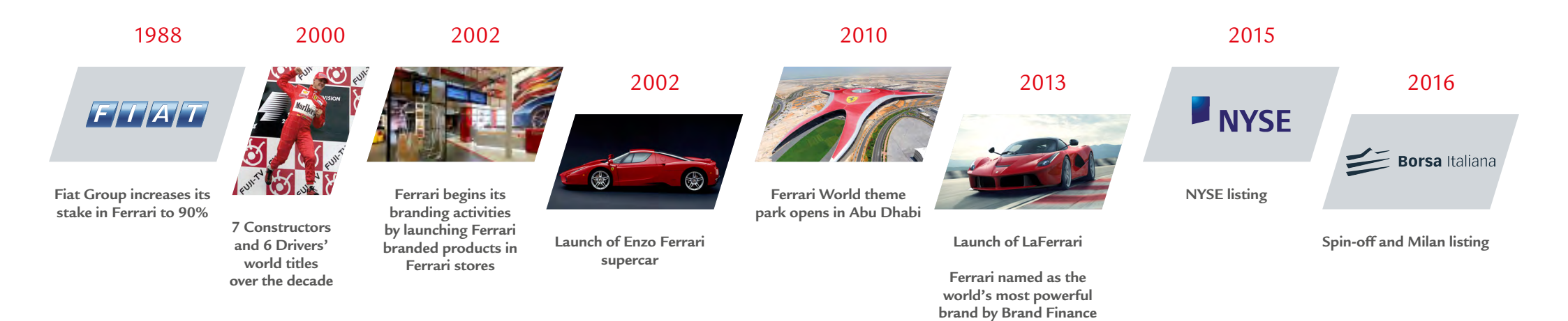
Launch of F40, the first supercar by Ferrari