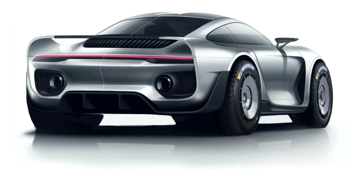
First sketch of the project by designer Alan Derosier

MARC PHILIPP GEMBALLA GmbH sees a new market opportunity in the creation of special design lead vehicles in a small production series – with a vision of creating holistic masterpieces – combined with a new fresh design and technology-focused approach, leaving the era of tuning behind, and ultimately achieving a USP position in the market.