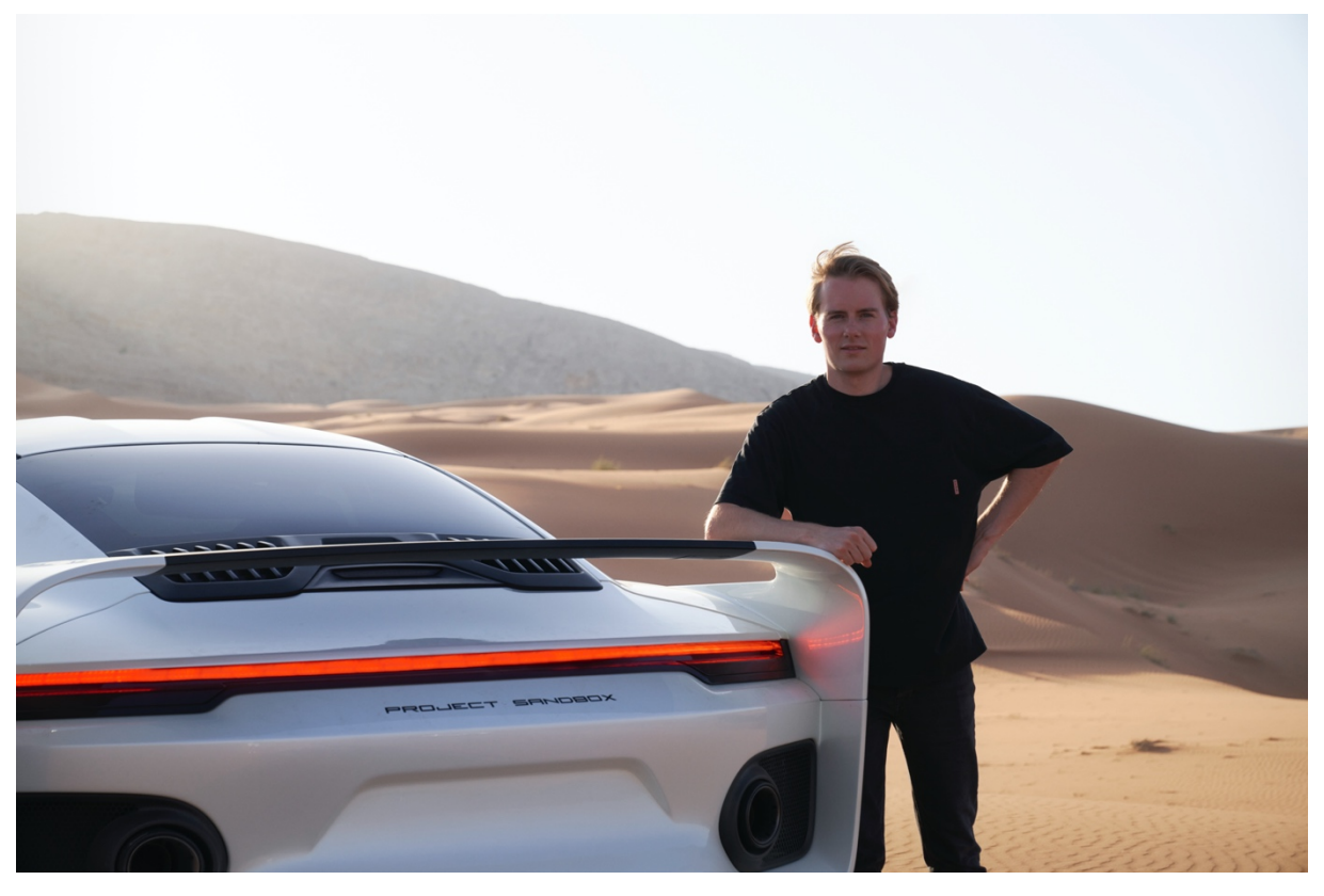
MPG with his very first production ready supercar in the Arabian desert

The price for conversion starts at EUR 495,000 net excluding taxes, duties, shipping, plus any special options and the cost of the Porsche 992 Turbo S base vehicle.