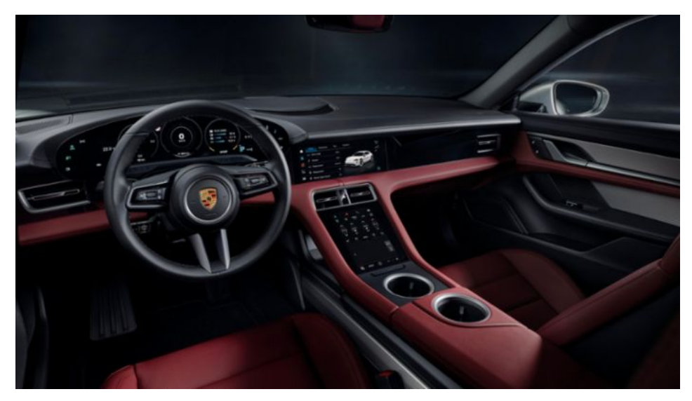
The Charging Planner has been further improved, is better at planning in fast-charging stations and avoids short charging stops

In addition to Apple Car Play, Android Auto has also been integrated into the Porsche Communication Management (PCM) system since the last model year update. As well as the iPhone, smartphones using the Google operating system – Android – are now also supported.