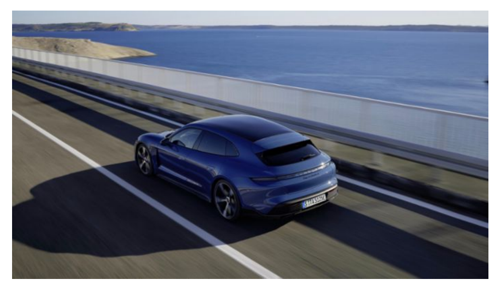
From a standstill, the Taycan Turbo S Sport Turismo accelerates from zero to 100 km/h in just 2.8 seconds and its top speed is 260 km/h

From a standstill, the Taycan Turbo S Sport Turismo accelerates from zero to 100 km/h in just 2.8 seconds and its top speed is 260 km/h. The model with the greatest range is the Taycan 4S Sport Turismo, which stretches to 498 kilometres based on WLTP figures. Being part of the latest Taycan generation, the all-wheel drive Sport Turismo models have a particularly efficient drive strategy. Thermal management and charging functions have also been improved.