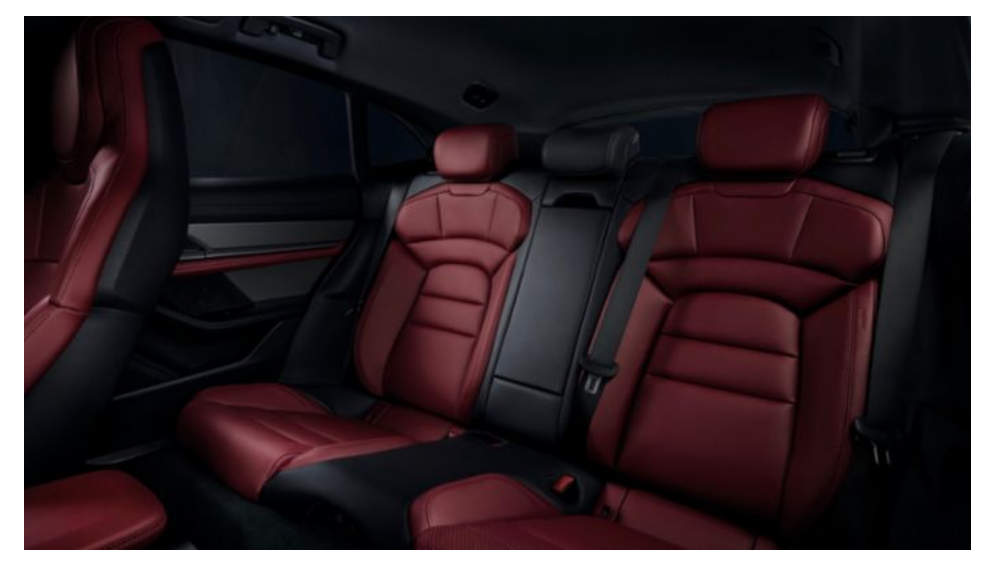
The headroom in the rear is more than 45 millimetres greater than that of the Taycan sports saloon

The precise capacity of the rear luggage compartment depends on the included equipment. In combination with the Sound Package Plus, the luggage compartment can hold up to 446 litres (saloon: 407 litres). With the BOSE® Surround Sound System on board (included as standard as of the Taycan Turbo Sport Turismo), it can hold 405 litres. With the rear seats folded down (split-folding 60:40), the capacity can even be expanded to 1,212 or 1,171 litres respectively. And that's before the 84 litres in the front luggage compartment (frunk) are taken into consideration.