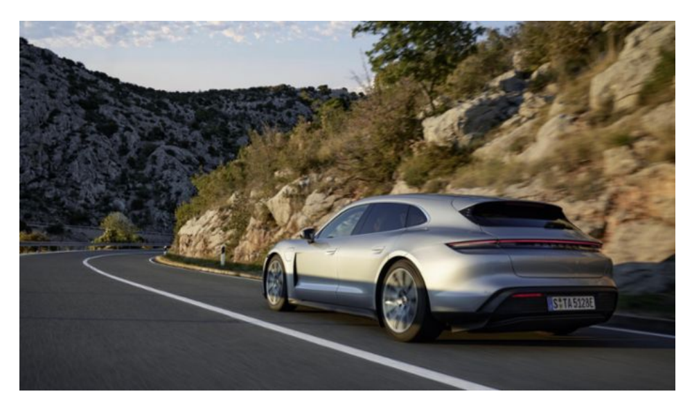
The new Taycan Sport Turismo: a practical all-rounder with on-road dynamics

The new derivative is aimed at people who want to combine the everyday usability of the Taycan Cross Turismo with the on-road dynamics of the Taycan sports saloon. As the first member of the Taycan Sport Turismo family, the GTS will be launched at the end of February 2022, with further models following just three weeks later in mid-March. A panoramic roof with Sunshine Control is available as a new optional extra for the Taycan Sport Turismo. A special feature of this is electric glare protection.