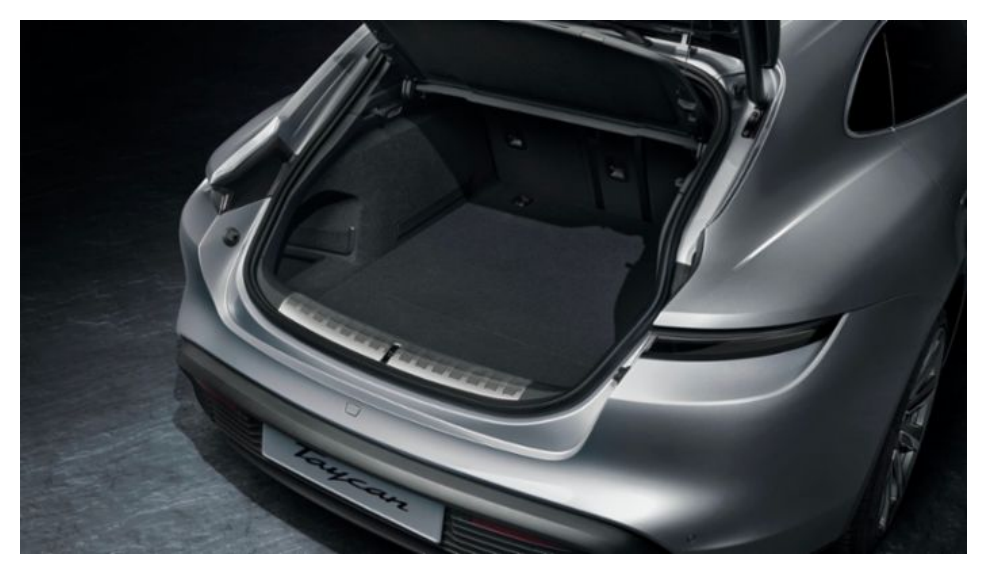
The capacity of the rear luggage compartment is up to 1212 litre

The new panoramic roof with Sunshine Control has electric glare protection as a special feature. The large glass surface is divided into nine sections that can be individually controlled. This means that specific sections or the entire roof can be made transparent or opaque. When set to the latter, the interior remains flooded with light.