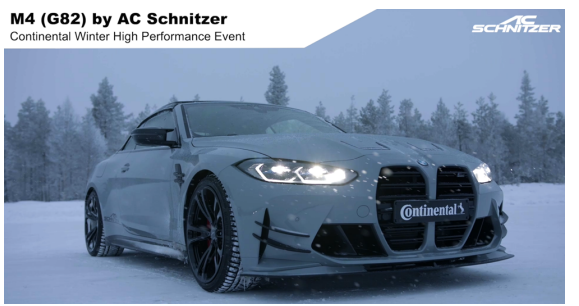
Test drivings at the Continental Winter High Performance Event in Rovaniemi, Norway