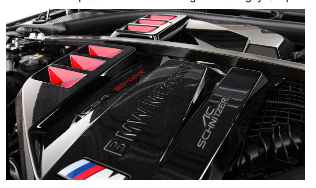
Performance upgrade <u>Step II 610 HP</u>: for BMW M4 (G82) Competition with 375 kW / 510 HP / 650 Nm standard to 449 kW / 610 HP / 750 Nm